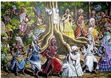
An illustration of some of the Yoruba Orisha