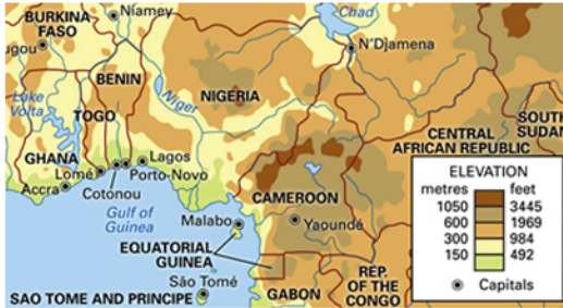
Map of West Africa

Rooted in West African traditional beliefs, Orisha's Journey is about a little girl and the power of imagination. Orisha, who doesn't believe in fables, finds herself in one. After meeting a lost flower spirit, she must journey through the world of spirits and the depths of her imagination to return the lost flower to the "Walking Forest."