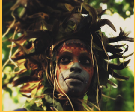
LITTLE GIRL, 2018