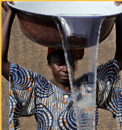
BURKINABÉ BOUNTY, 2018

Two down-on-their-luck con men desperately need to make a few bucks. They decide to pose as pastors in order to waylay a desperate wealthy man with a sick daughter.